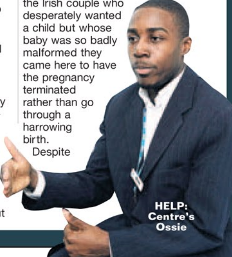
HELP: Centre's Ossie