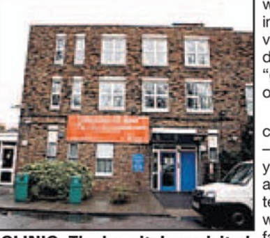
CLINIC: The hospital we visited