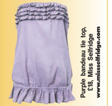
Purple bandeau tie top, £18. Miss Selfridge www.missselfridge.com