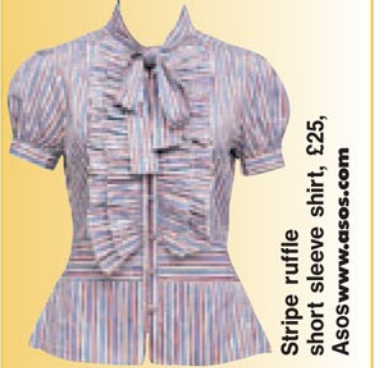
Stripe ruffle short sleeve shirt, £25. www.asos.com