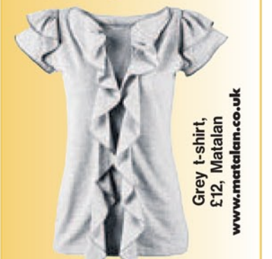
Grey t-shirt, £12. Matalan www.matalan.co.uk