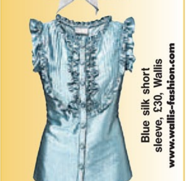
Blue silk short sleeve, £30. Wallis www.wallis-fashion.com