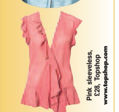
Pink sleeveless, £28. Topshop www.topshop.com