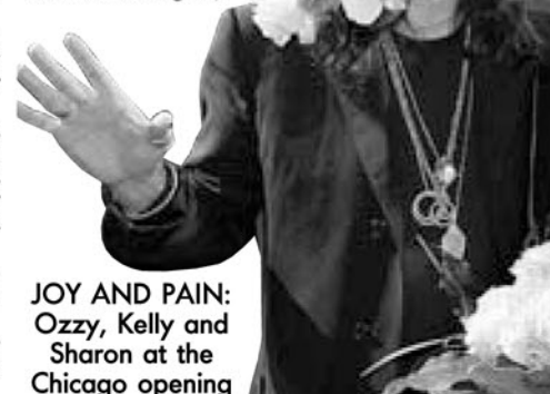
JOY AND PAIN: Ozzy, Kelly and Sharon at the Chicago opening

As well as starring on X Factor alongside Simon Cowell, Louis Walsh and Dannii Minogue,